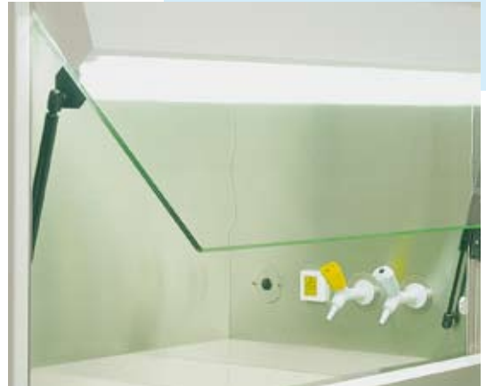
Front door in tempered glass with gas springs