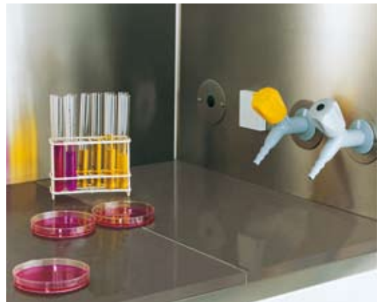
Standard delivery includes U.V. lamp, electrical socket and 2 stopcocks